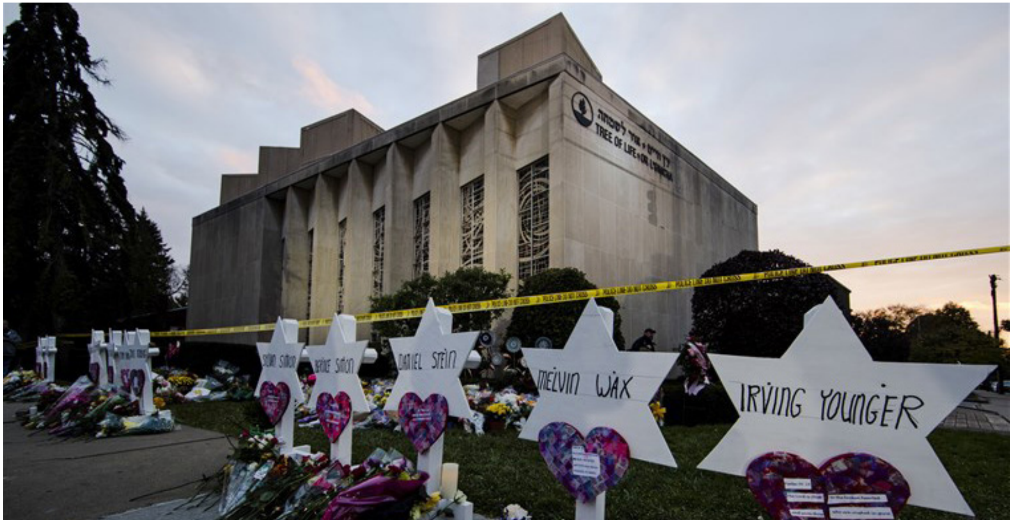
Robert Bowers, who killed 11 people in a synagogue in Pittsburgh in October, was well-known and active on Gab, a Twitter alternative popular with white supremacists.